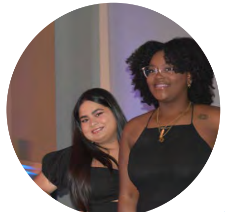
BLACK HISTORY MONTH BALL