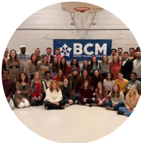
Baptist Collegiate Ministry