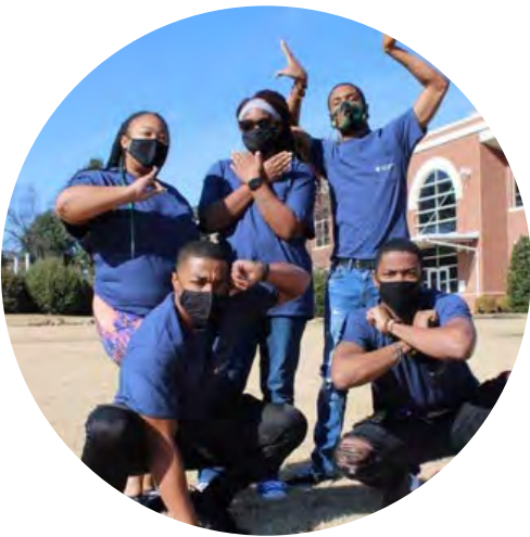
Black Greek Letter Organizations