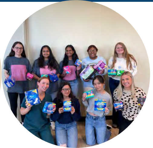
BEING _____ AT AUGUSTA UNIVERSITY