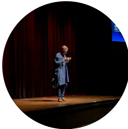
UNITY TALENT SHOW