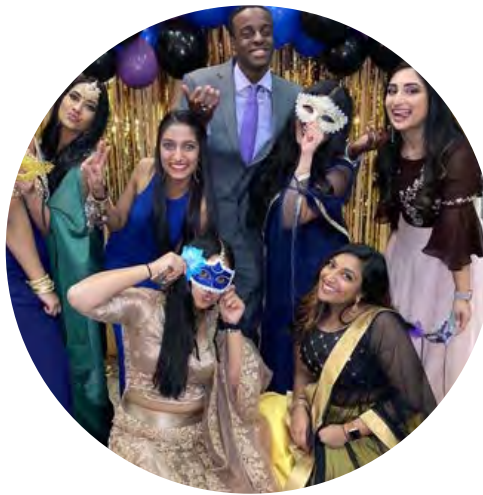
Indian Cultural Exchange