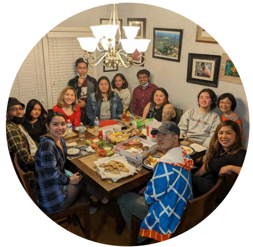
Asian Students In Augusta