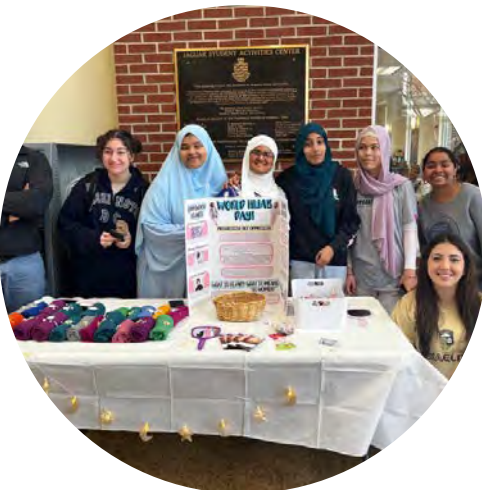
Muslim Student Association