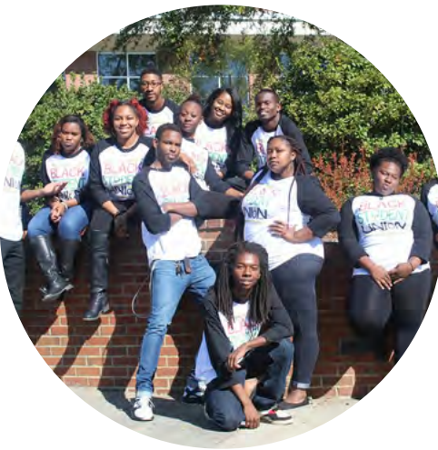
Black Student Union