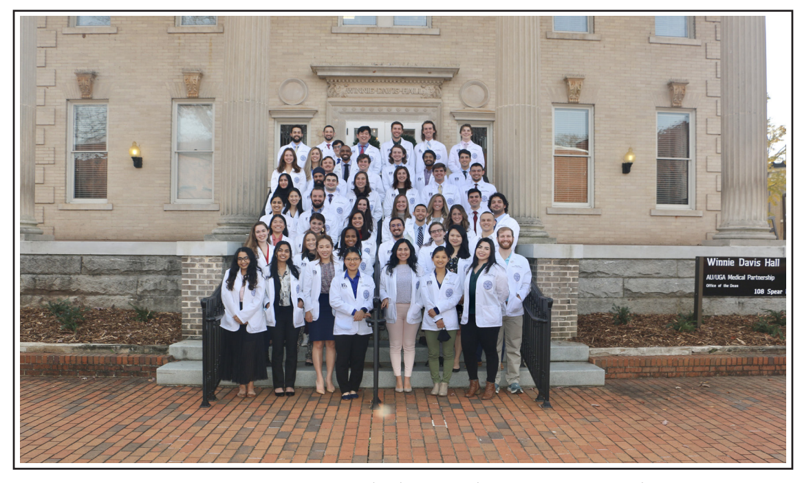
Medical Partnership Campus, 2020 White Coat Ceremony