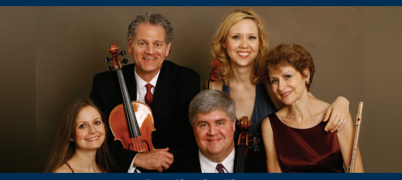
American Chamber Players