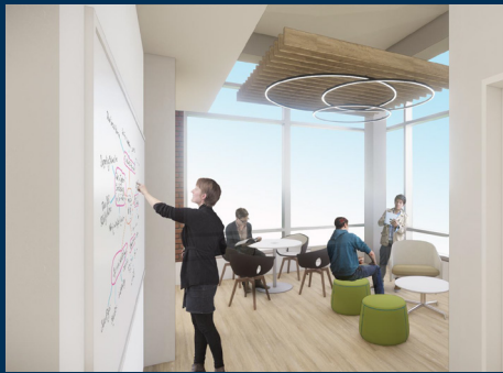
Second Floor Collaborative Area