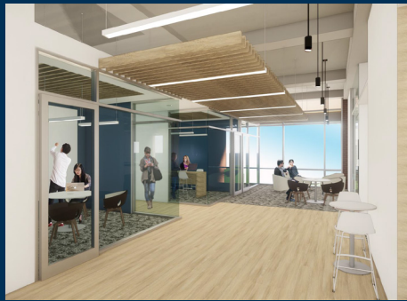
Second Floor Shared Student Space