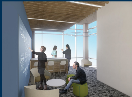
Third Floor Collaborative Area