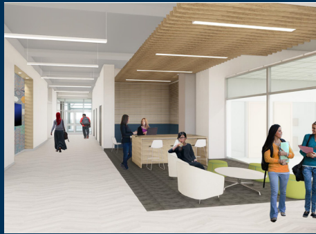
First Floor Lobby