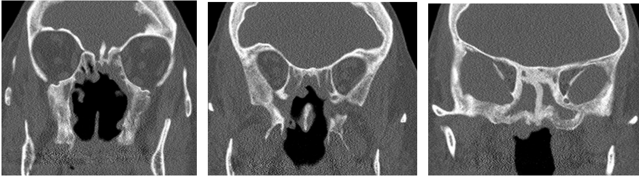
Figure 1: Coronal Sinus CT (continued)

The patient was treated with rituximab, and BID nasal irrigations using budesonide and mupirocin. One year after initiation of treatment she had dramatic improvement of her symptoms and was able to discontinue systemic steroids and methotrexate.