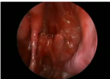
Video: Nasal endoscopy two years after initiation of rituximab infusions.

During her last visit, two years after initiation of treatment, the patient continues to improve and nasal endoscopy showed reduced mucosal inflammation and minimal crusting (Video).