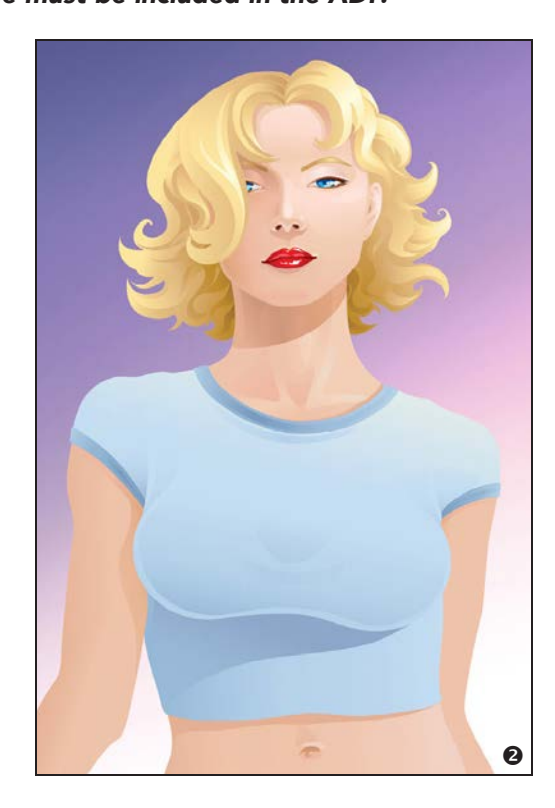
"How to Make a Fake Shot," by K. Piciacchia ('21).

All applicants must submit a digital portfolio of original creative work. The Applicant Digital Portfolio (ADP) must be submitted online following the instructions for the MIGP Applicant Digital Portfolio. The ADP must be submitted as a PowerPoint, using the MIGP PowerPoint Template. The ADP must be received by midnight on January 10. The portfolio must contain 20 pieces of original creative work. Specific required works are listed in the ADP instructions. All artwork must be drawn from direct observation (not from photographic or video reference unless the photo or video was taken by the applicant). One (1) vector- or bézier-based computer-graphic image must be included in the ADP.